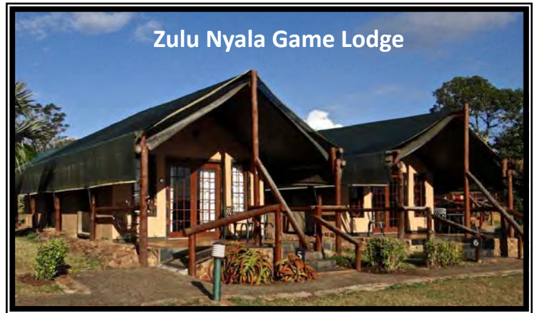
Zulu Nyala Game Lodge