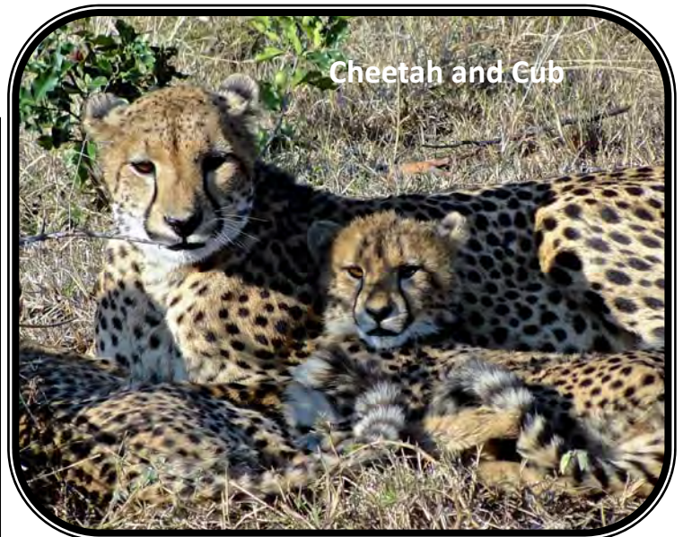
Cheetah and Cub