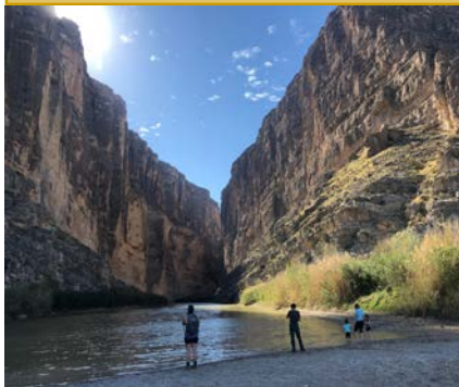
Santa Elena Canyon, Big Bend Nat'l Park Rio Grande River, Mexico to left, US on right!